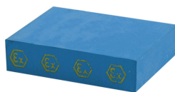
Module de compensation plein CM Ex